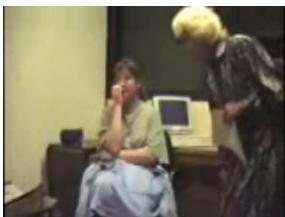
BEFORE SDI PROCESSING