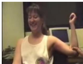
5 Minutes AFTER SDI processing